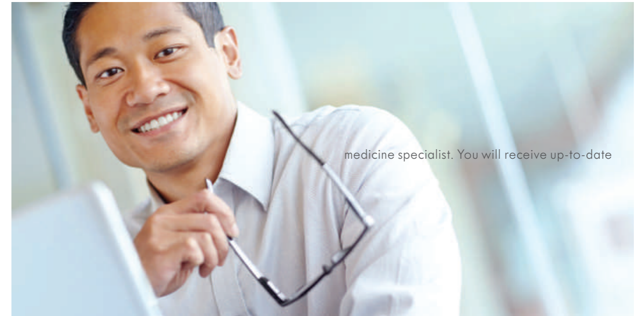
medicine specialist. You will receive up-to-date

Your Wellness medical director may recommend one or more of the following services based on your individual needs. Please consult your Executive Wellness concierge for fees and other inquiries, including the potential for an extended stay. Coverage through insurance may vary per employer. Your concierge also can assist you with scheduling any recommended follow-up specialty appointments that result from your physical.